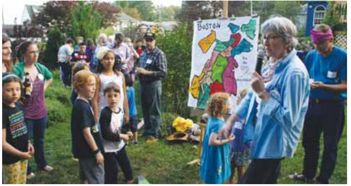
Among the various activities at the RISE party was pin the heart on Roslindale, a variation of the pin the tail on the donkey game.