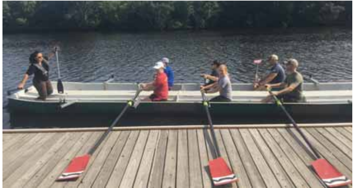
Hope for the Warriors conducts a rowing clinic to reinvigorate veteran's camaraderie and strengthen their relationship with the community. They held a rowing event in Brighton over the weekend to this end.