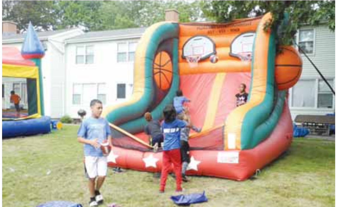
Kids shoot baskets at the Fairmount Housing Community's Unity Day, an annual summertime event.