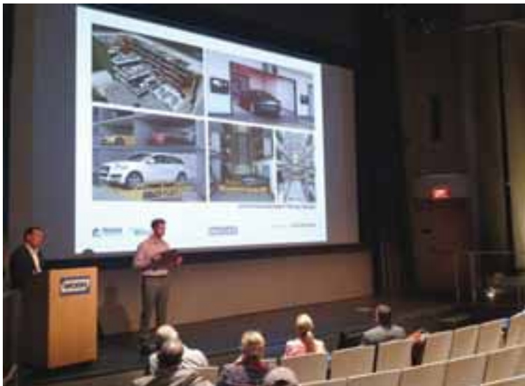
Allston and Brighton residents both said they don't want more rentals in their respective neighborhoods until more homeownership is created.

The proposal calls for 261 rental units, and would take up an envelope of 248,088 square feet, with an automated parking structure of 46,350 square feet. The automated parking structure – which would use a lift system similar to what is