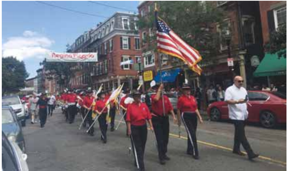
The bands came marching down the streets of the North End to celebrate the Feasts of St. Anthony over the annual three-day festival.