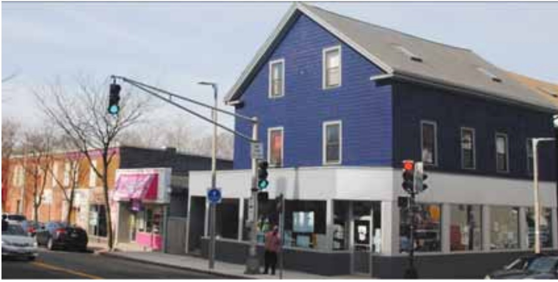
3353 – 3375 Washington St.: Two developments planned for this site have been stopped: one because of a lawsuit; the second because of the steep affordability requirements in Plan JP/Rox.